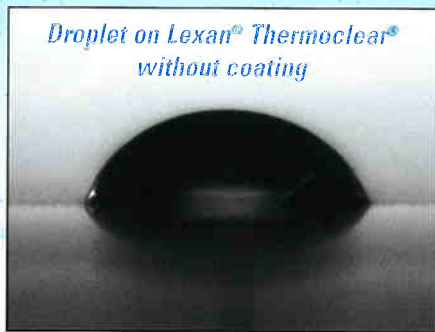
Contact angle of 66°